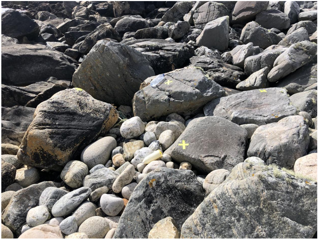
drift constellations, Lewis