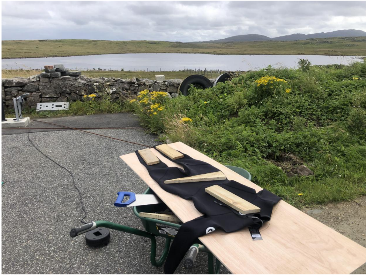
Making a wooden template for Raft1, Grinneabhat, Bragar.