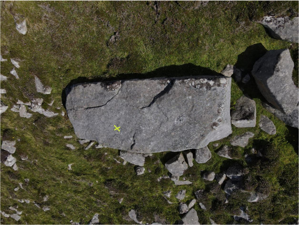
Drift constellations, glacial erratic.