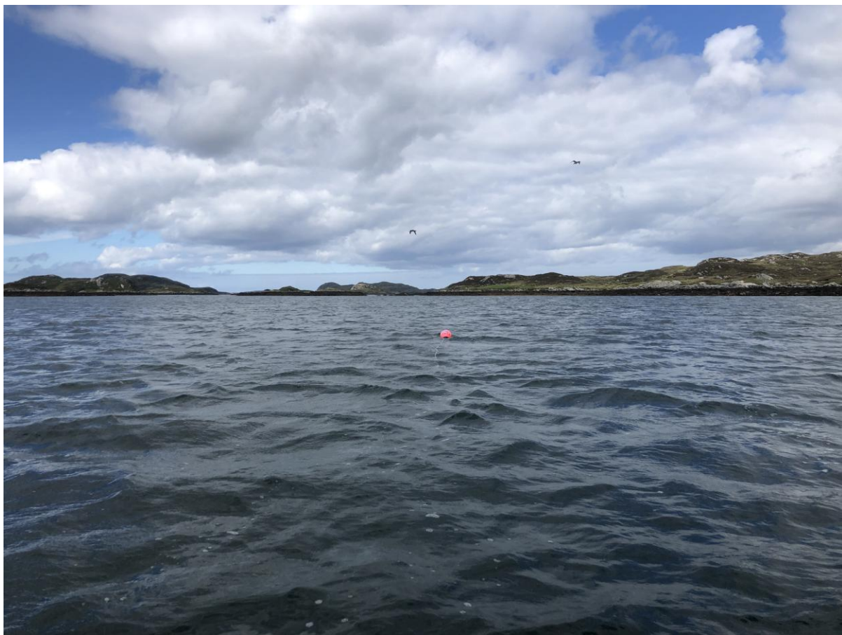
Raft 1 at Strome, Lewis.