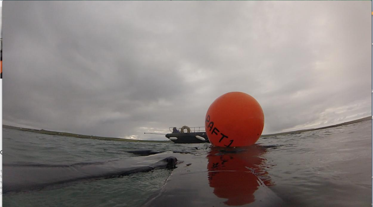
Raft 2, Papa Westray.