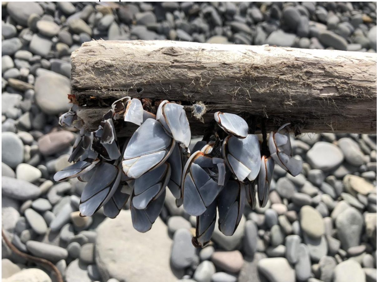
Goose Barnacles on log from possibly Canada, Papay.