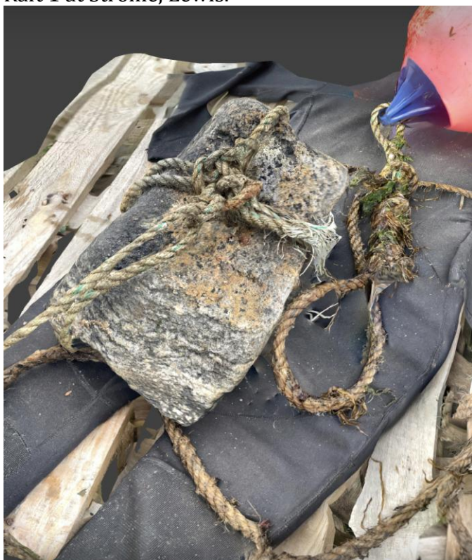
Raft 1: 3D scanned image - tethered anchor stone with buoy and neoprene wetsuit.