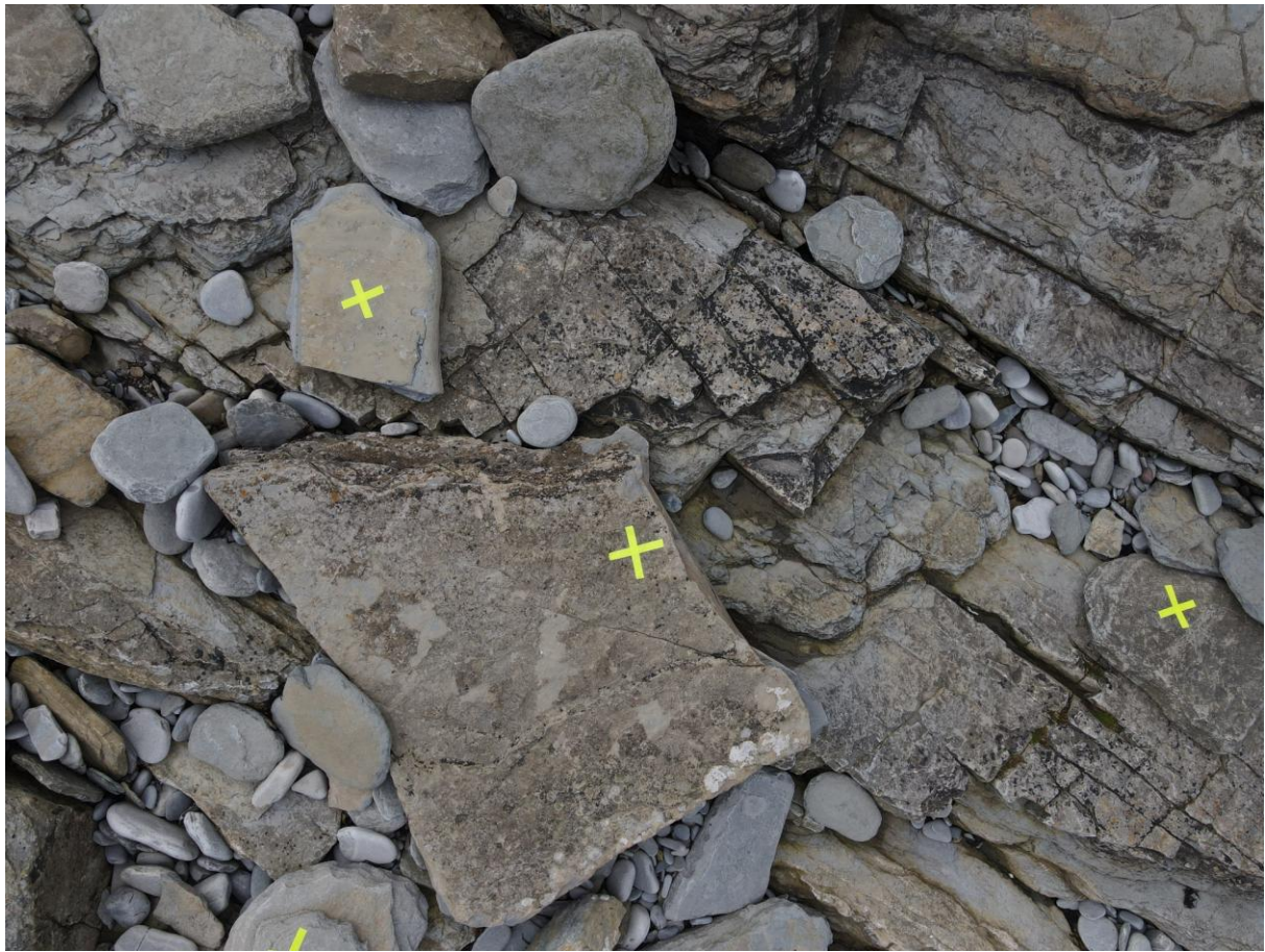
Drift constellations, Herti's Geo, Papa Westray