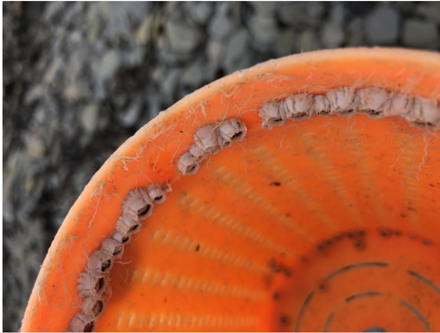
Plastic bucket with limpet species.