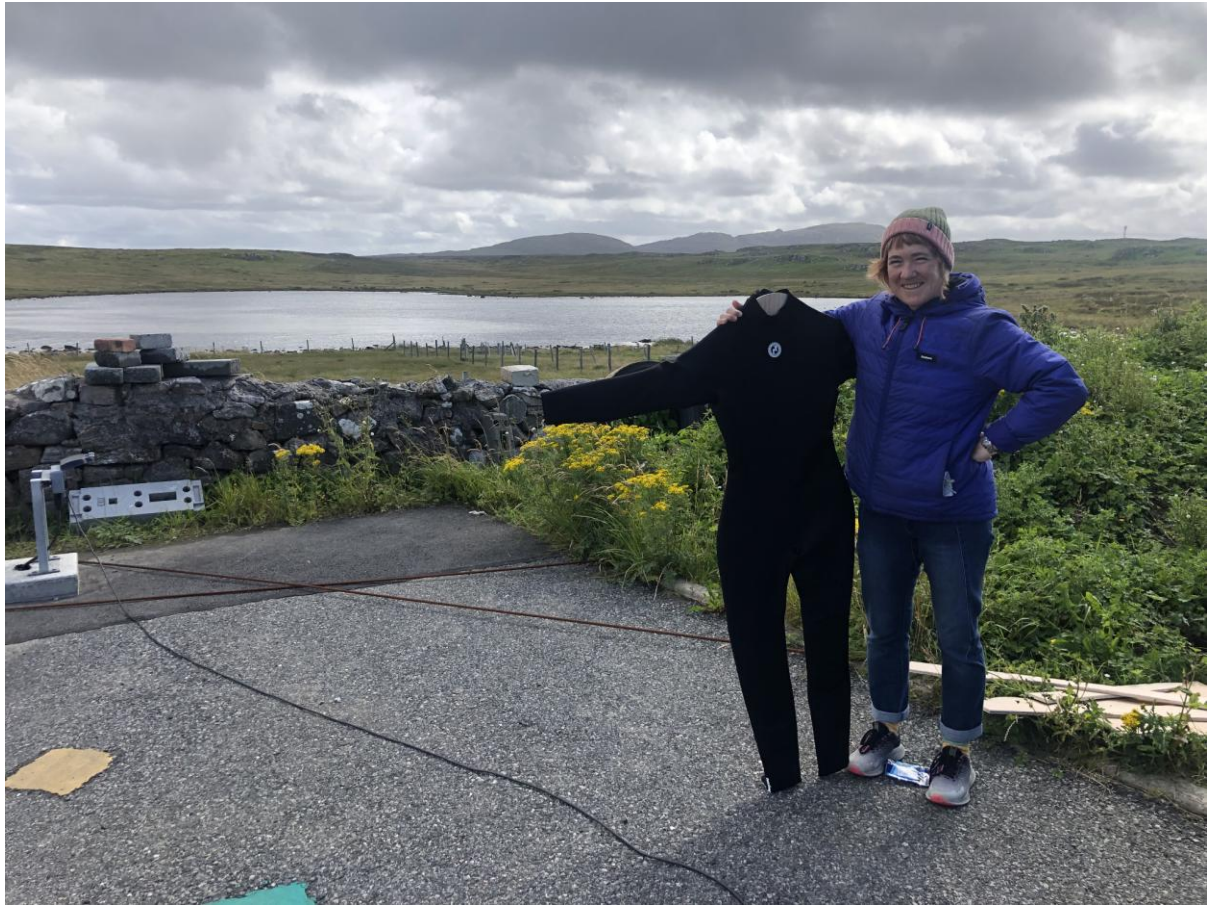
artist with wetsuit Raft 1, Grinneabhat, Bragar.