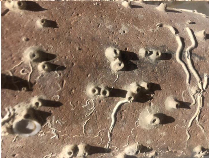
Ancient Roman rafting species detail – Roman amphora from the ocean, Sicily.