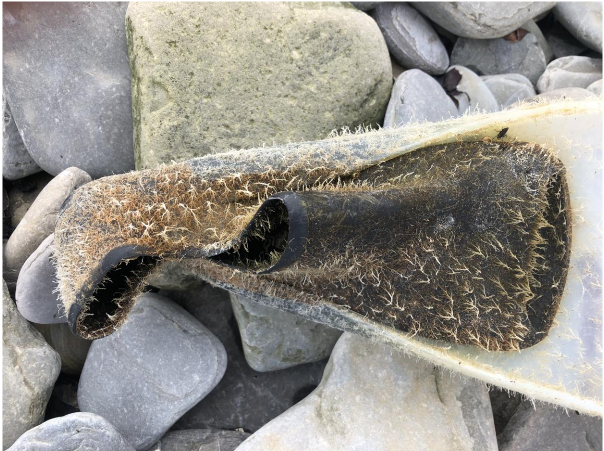
Diving flipper raft