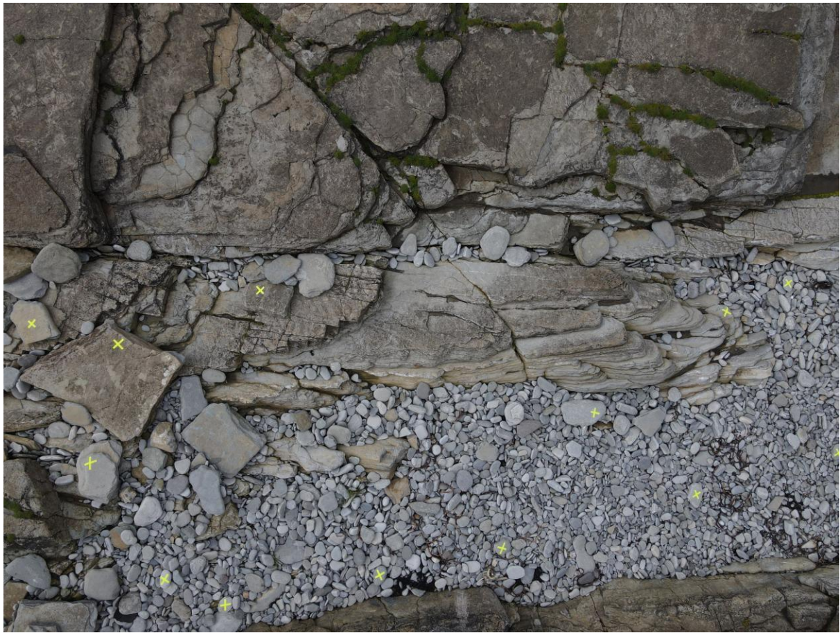
Drift constellations, Herti's Geo, Papa Westray