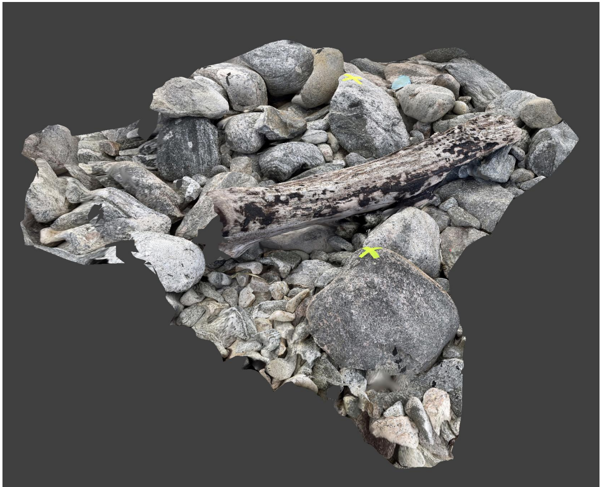
3D scanned rocks and washed up log, Lewis.