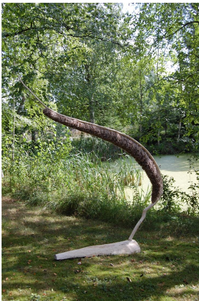
Finland 2010. Untitled Sculpture - found wood and common reed