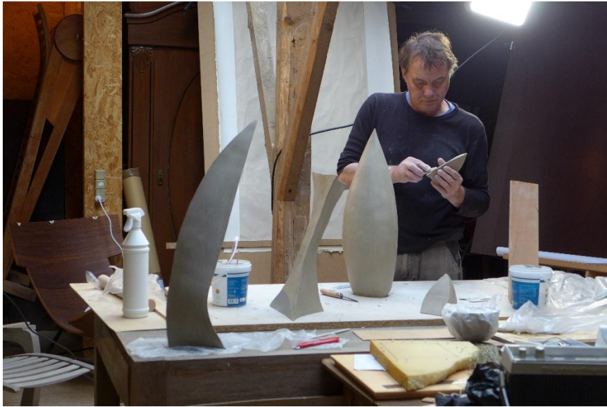
Ripple Kare Project. Norup Sawmill Residency 2015. Making Clay Forms for Water Project