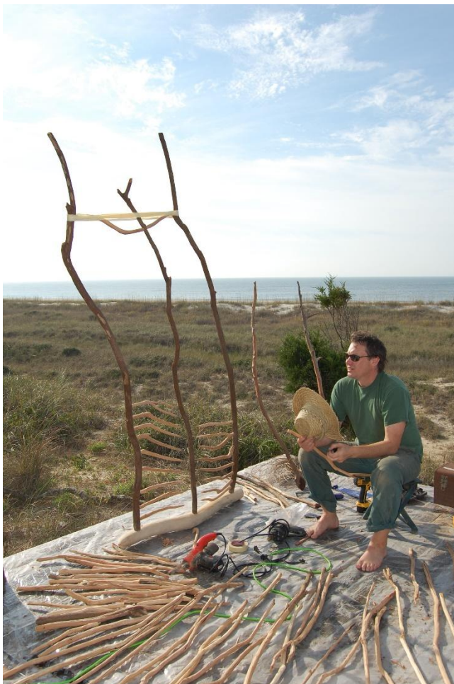
No Boundaries residency North Carolina 2009