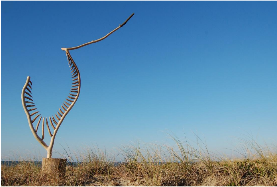
No Boundaries Residency 2010. Finished sculpture made from found wood photographed in the dunes on Bald Head Island